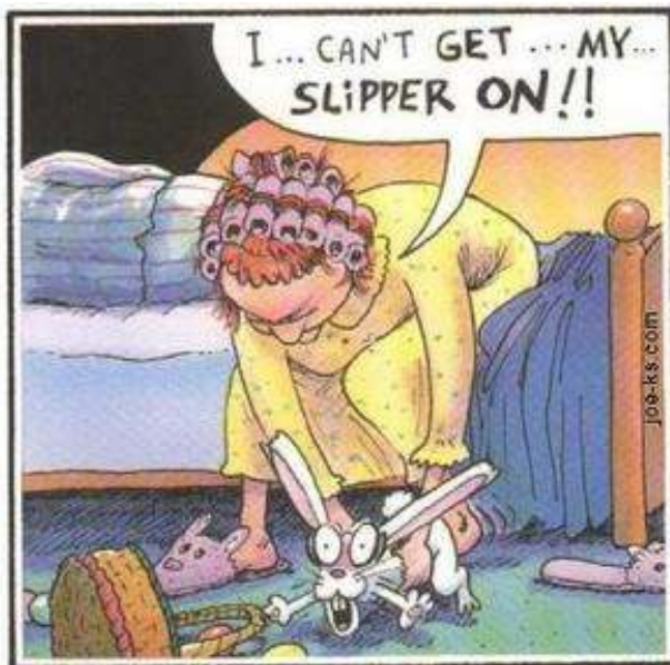
THE EASTER BUNNY GETS A RUDE AWAKENING.

Remember, too, the rest of the rules that your mother hopefully taught you. You're in someone's home, treat it