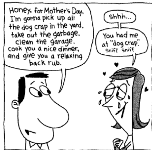
Real Life Love Scenes

President Woodrow Wilson, in 1914, made the official announcement proclaiming Mother's Day as a national holiday and ordered the United States flag displayed on all public buildings.